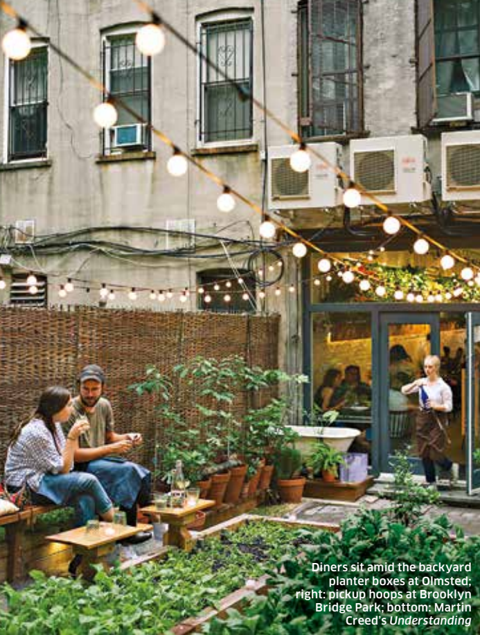
Diners sit amid the backyard planter boxes at Olmsted; right: pickup hoops at Brooklyn Bridge Park; bottom: Martin Creed's Understanding