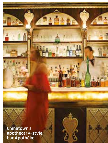
Chinatown's apothecary-style bar Apotheke

Rothkopf, who tells us about the Whitney's recent move. "We feel like we have not just expanded our museum but have become part of a hugely changing psychogeography of New York," he says. "The way people think about the city has really changed, and the way they move around it and the places they visit."