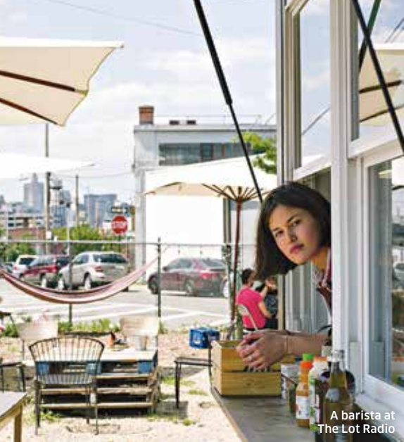
A barista at The Lot Radio

Understandably, we need to sit for a while, and we've got just the place: Citi Field, the Flushing home of the New York Mets. The Yankees may be the iconic local baseball team, but the Mets have recently surpassed the Bronx Bombers in popularity thanks to their superior stadium—which was inspired by Ebbets Field, the long-ago home of the Brooklyn Dodgers—and their exciting squad, which made it to the World Series last year. Today, the Mets have a Fall Classic rematch with the champion Kansas City Royals, and they win 4-3 behind Noah Syndergaard, a 24-year-old pitcher nicknamed Thor for his long blond locks, 6-foot-6 frame, and 98-mph fastball.