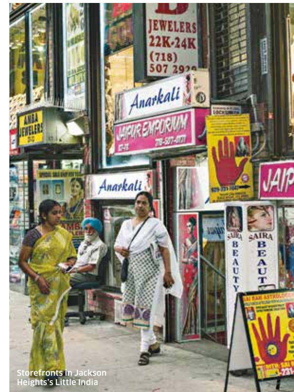
Storefronts in Jackson Heights's Little India

From there, we pass a clutch of Thai spots and cross Diversity Plaza, the storefronts now bursting with colorful Bangladeshi signs. We grab a jhal muri (puffed rice, chickpeas, spicy mustard oil) from an 87-year-old street cart vendor and eat as we walk, the signage around us changing