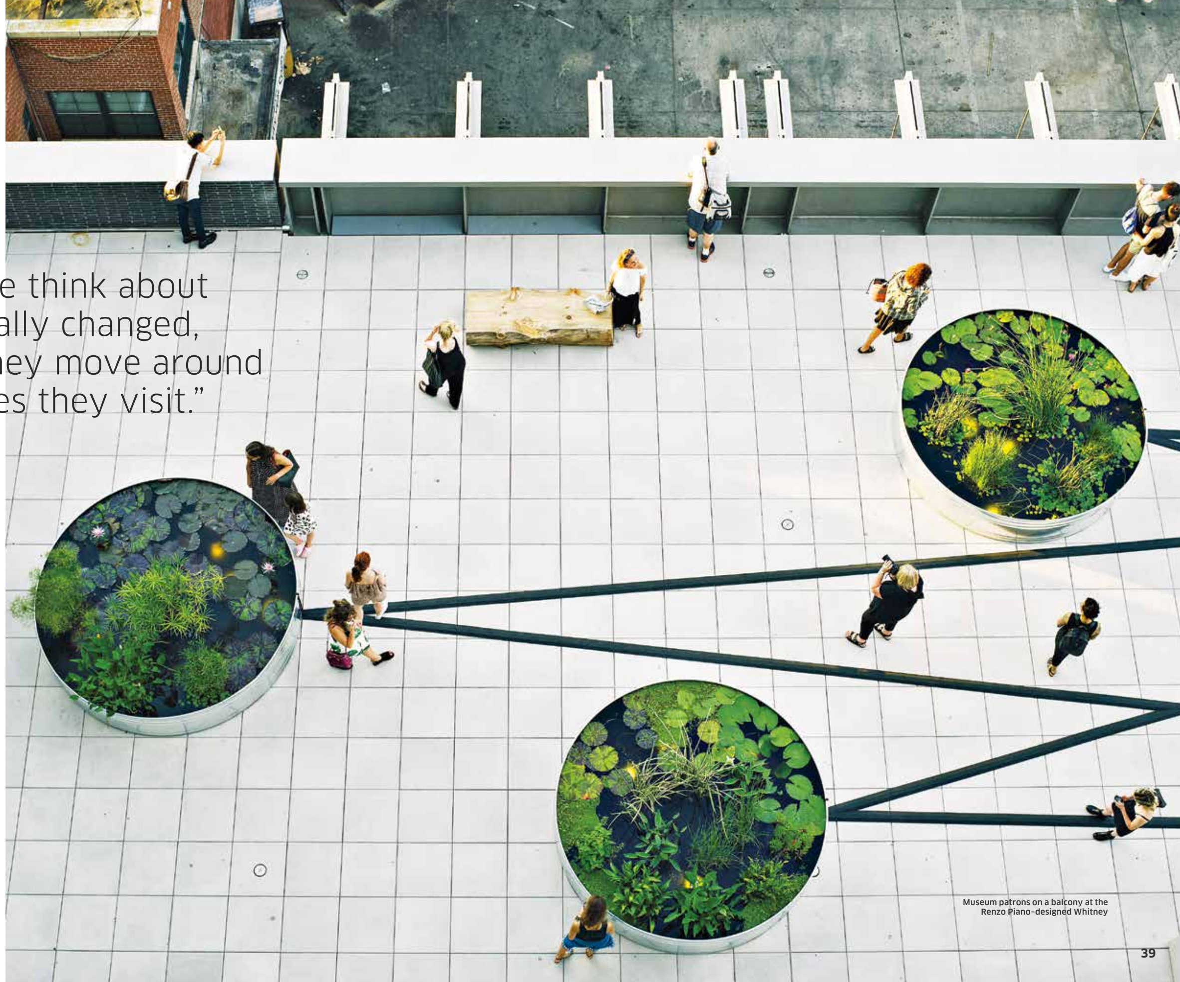
Museum patrons on a balcony at the Renzo Piano-designed Whitney

For a post-performance drink, we cab it to Chinatown’s Doyers Street, a crooked alley once known as “the Bloody Elbow” for the unwholesome activities that took place here. We step through an unmarked doorway and into Apothéke, a sultry lounge in a former opium den. We order cocktails from the prescription-themed menu: From the “Stress Relievers” section, we get a Siren’s Call (Ford’s gin, roasted seaweed, cucumber, squid ink, ginger, black smoked sea salt); from “Pain Killers,” it’s a Catcher in the Rye (rye, amaro