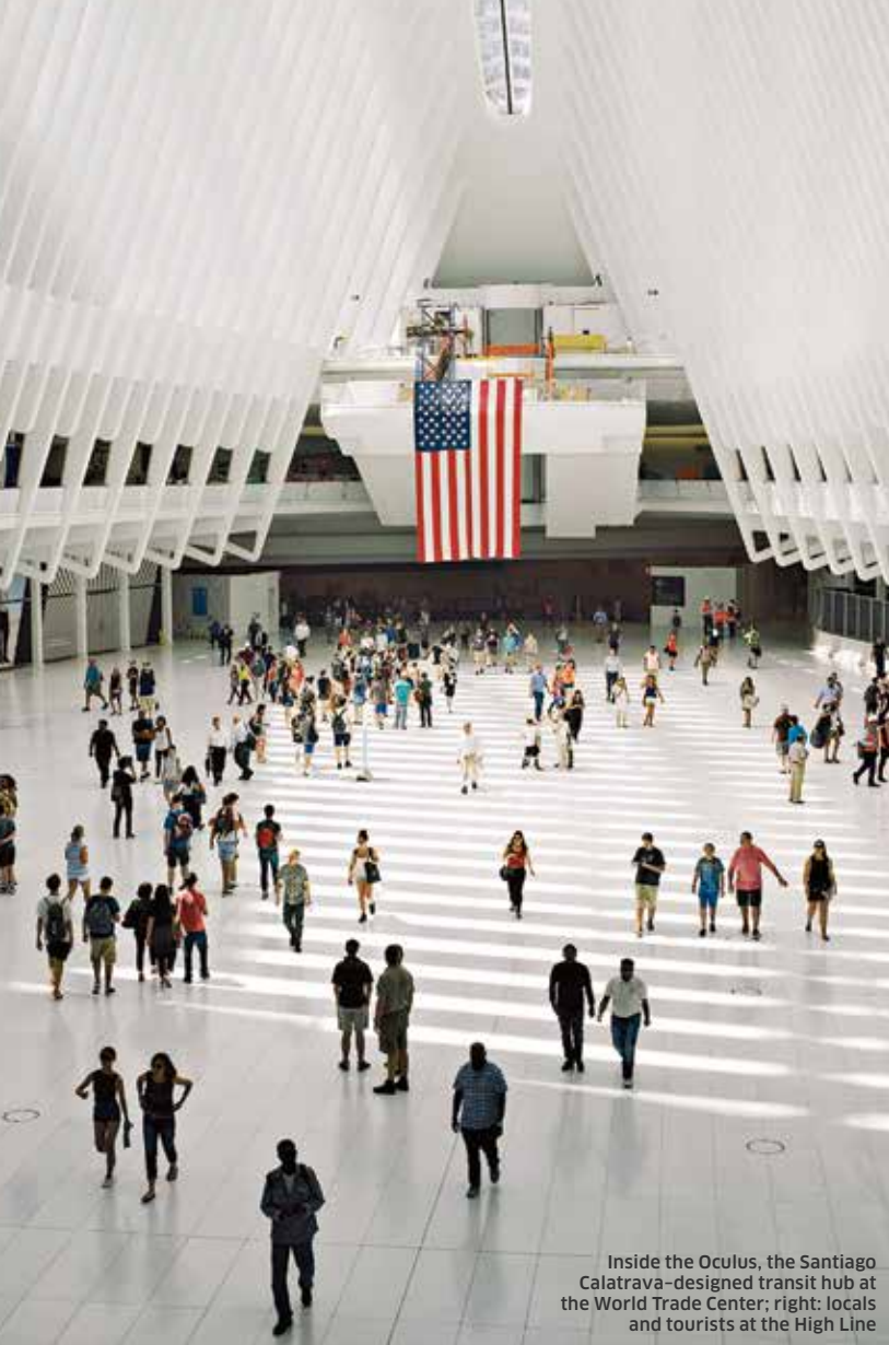
Inside the Oculus, the Santiago Calatrava-designed transit hub at the World Trade Center; right: locals and tourists at the High Line

Nonino, honey cordial, chamomile bitters, peated scotch mist). They taste so good that we don't notice how strong they are until it's too late.